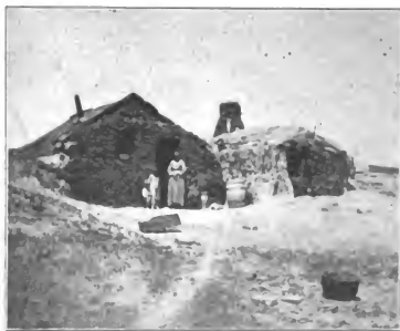
PIONEER RESIDENCE, SHORT GRASS COUNTRY.

The short grass section therefore embraces portions of Harper, Kingman, Reno, Rice, Ellsworth, Lincoln, Mitchell, Jewell counties, and all of Smith, Osborn, Russell, Barton, Stafford, Pratt, Barber, Comanche,